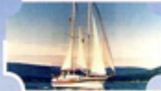
SCHOONER MALLORY TODD Capacity: 40, Length: 65 ft 206/381-6919 www.sailseattle.com