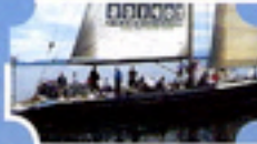
OBSESSION Capacity: 49, Length: 70 ft 206/624-3931 www.sailingseattle.com