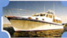
SEEKER Capacity: 40, Length: 50 ft 206/781-0709 www.anchorbaycharters.com