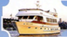
MATCH MAKER Capacity: 48, Length: 67 ft 206/286-9711 www.cristakcharters.com