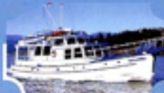
SACA JAWEA Capacity: 30, Length: 62 ft 800/676-7678, 253/537-7678 www.cruise-nw.com