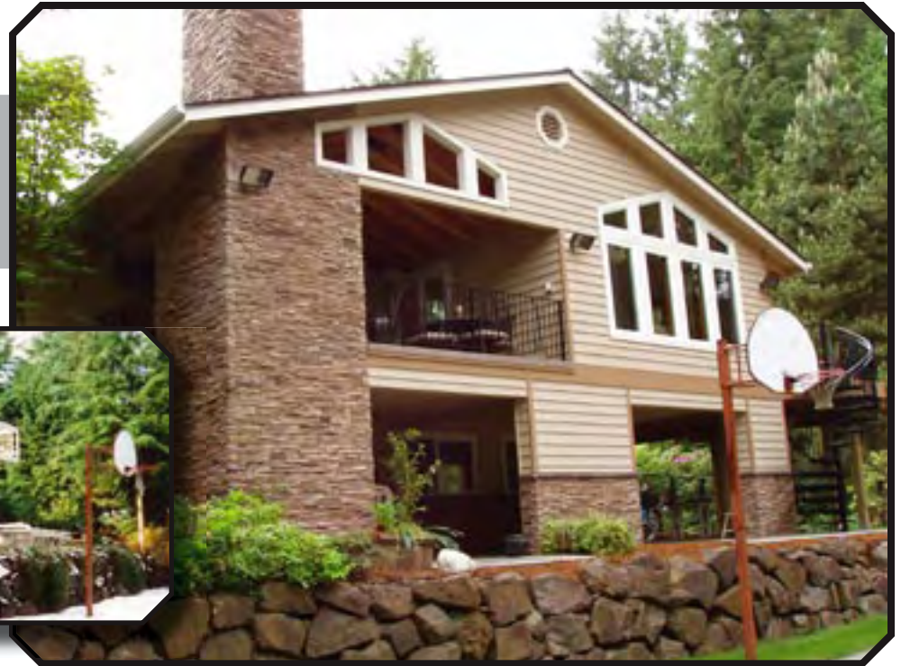
Right: Same house after addition of outdoor living space