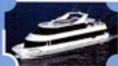
OLYMPIC STAR Capacity: 149, Length: 90 ft 206/223-2060 www.waterwayscruises.com