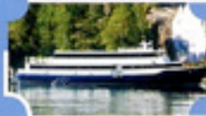
ISLAND SPIRIT Capacity: 49, Length: 130 ft overnight reboats 800/234-3861 www.sanjuanislandcruises.com