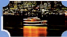
ISLANDER Capacity: 237, Length: 72 ft 425/455-5769 www.champagnecruise.com