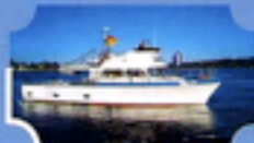
JOKER Capacity: 28, Length: 48 ft 360/479-3391 www.ventsrecharterboats.com