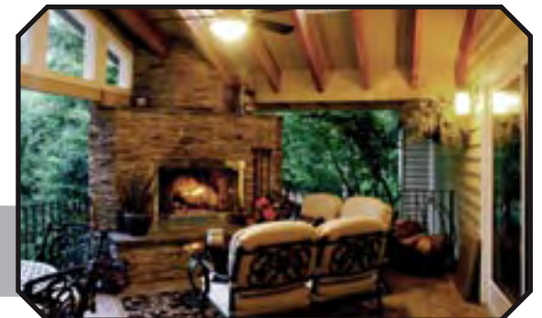
Right: Upper Floor interior of outdoor living space

Heritage, along with ten full time employees, dedicates itself to maintaining professionalism in the remodeling industry. Heritage cares about its customers, employees and the communities where we live and work. Heritage represents commitment, pride, teamwork, and the quality workmanship it takes to make your dreams a reality.