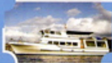
MY GIRL Capacity: 100, Length: 72 ft 206/324-6009, 253/927-5351 www.mygirltheboat.com