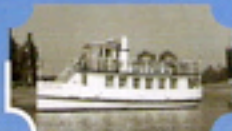
FREMONT AVENUE Capacity: 48, Length: 50 ft 206/713-8446 www.seattleferrieservice.com